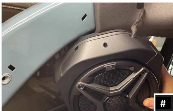
C. Snap the speaker pod harness cover onto the pod making sure the harness exits the cover through one of the two reliefs.