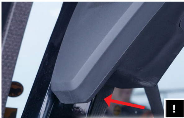
A. Remove the screw located at the bottom of the speaker enclosure.