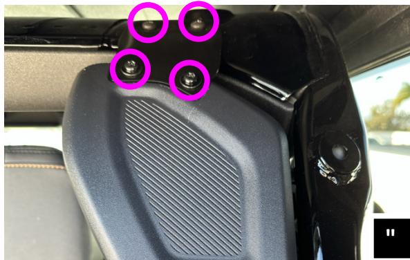
B. Removing the two screws securing the bracket to the vehicle. Then remove the two screws securing the bracket to the enclosure.

Note: These 4 factory screws will be re-used for the SSV pods. *This image is of passenger side.