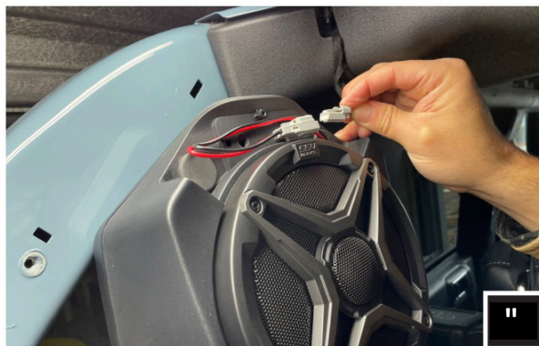
B. Hold the pod up near its mounting location and connect the factory harness.