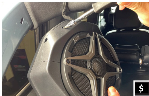
D. Use the provided Philips screw to secure the cover in place. E. Loosely assemble the bottom of the pod to the frame of the vehicle using the provided M6 screw and washer.