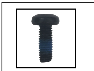
(x2) M6 x Screw