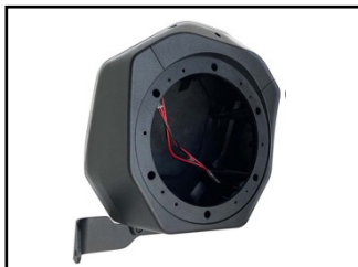
Passenger Rear Door Pod