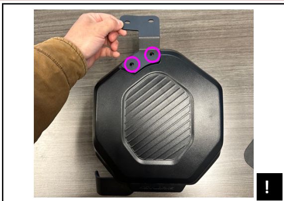
A. Secure the drivers side bracket to the driver side pod using the factory two screws.