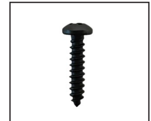
(x2) #1 Phillips Screw