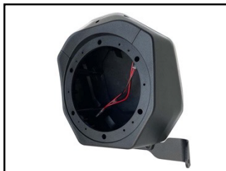
Driver Rear Door Pod